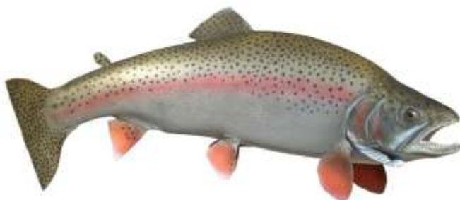
Fins and scales