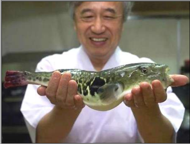
Fugu chef about to prepare a blowfish

has resulted in dozens of fatalities with many more becoming extremely ill after consuming its meat.