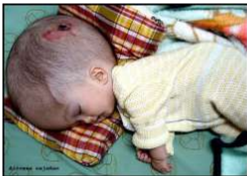
Infant with hydrocephalus due to congenital toxoplasmosis

spleen, diarrhea or vomiting, feeding problems, seizures and jaundice. Many of these symptoms can lead to permanent disabilities such as: abnormal brain and nervous system function, eye damage from inflammation of the retina or other parts of the eye, and hearing loss.