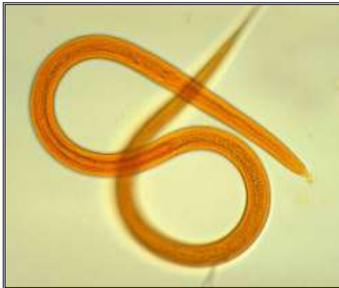
Trichina (a.k.a. roundworm) found in swine's flesh

Due to their design and behavior, swine flesh contains contaminants such as trichinella, tapeworms, and toxoplasma gondii. Therefore, pork must be raised and cooked in a specific manner in order to avoid infection. If not properly prepared, swine can transfer parasites that live in its muscle tissue. Ingestion of meat containing live trichina larvae produces nausea, heartburn, dyspepsia, and diarrhea within a few days. Later, as the worms encyst in different parts of the human body, other manifestations of trichinosis appear such as headache, fever, chills, cough, eye swelling, joint and muscle pain, broken capillaries and itching.