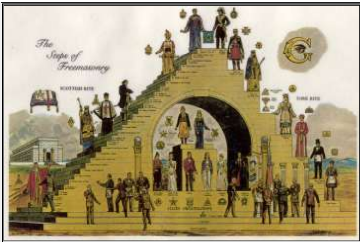
An illustration of Freemasonry's steps of degree

The Blue Degrees are but the outer court or portico of the Temple. Part of the symbols are displayed there to the Initiate, but he is intentionally misled by false interpretations. It is not intended that he shall understand them, but it is intended that he shall imagine he understands them. Their true explication is reserved for the Adepts, the Princes of Masonry. The whole body of the Royal and Sacerdotal Art was hidden so carefully, centuries since, in the High Degrees, as that it is even yet impossible to solve many of the enigmas which they contain... Masonry is the veritable Sphinx, buried to the head in the sands heaped round it by the ages (ibid, p. 819).