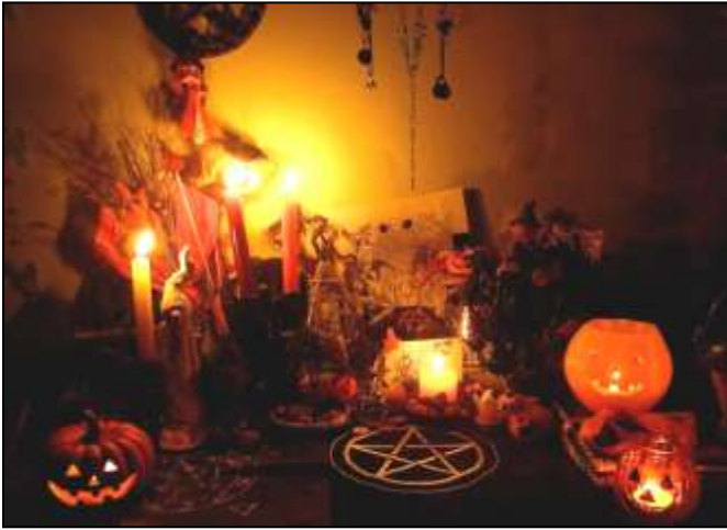
A Wiccan Samhain altar

apples and squash, along with a skull, which is a symbol of physical passage. The Samhain altar also is personalized with framed photos and favorite foods of ancestors. During Samhain we actually make something (food) our ancestors loved... (Napa Valley Register, Oct. 28, 2011).