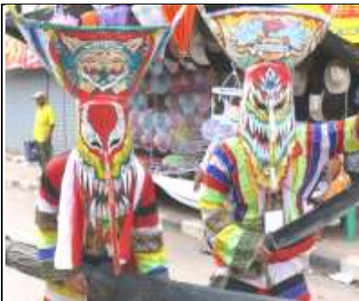
Asian Ghost Festival

O all your ancestors, who are departed, deign to come and eat what we have prepared for you, and to bless your posterity and to make it happy ( Notice sur le Cambodge , p. 59).