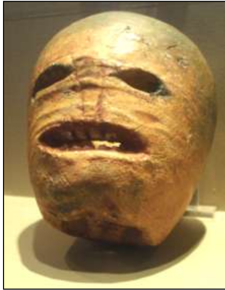
Traditional Irish Jack o' Lantern

used. Immigrants brought this tradition to America and soon found that pumpkins make perfect Jack o' lanterns.